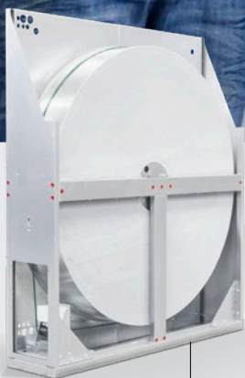
Regoterm 270 Premium rotary heat exchanger

» New component choices for eQ Prime and Master will help you deliver on highly set targets for overall energy efficiency and reduced running costs.