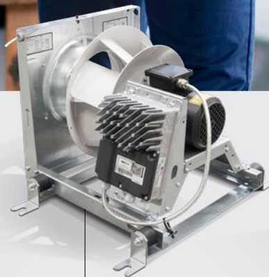
CentriFlow 3D plug fan with efficient mix flow impeller design