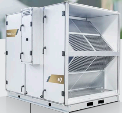
Recuterm Crossflow and Counterflow plate heat exchangers

At FläktGroup we are always working on ways to improve the functionality and efficiency of our products – whether it is through gradual development or great innovation. Recently we have released three new components that make it possible for you to increase the efficiency of the eQ Prime and eQ Master series of Air Handling Unit even further, and at the same time give you more choice to tailor the the units to your specific needs.